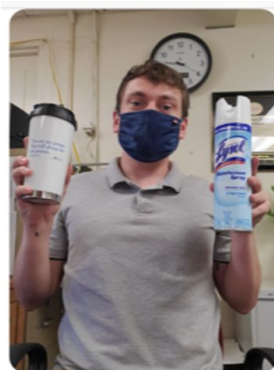
Coffee and disinfectant... my two essentials!!