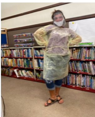
Trying all the ppe 😊 I figure you need a giggle!